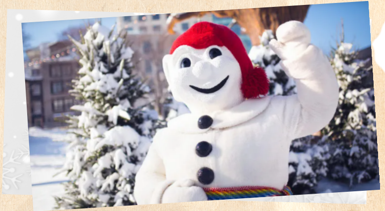
Bonhomme: The Star of Quebec Winter Carnival

The Night Parade is one of the classic and popular activities among the various events in the Carnival. Both young and old people are attracted by the colourful performances. There are two night parades featuring Bonhomme, who is the star of the Carnival, which is the most popular parade in the country. Another example is the Ice Canoe Race. Ice canoe racing is an extremely competitive sport. Teams make multiple crossings over the frigid water of the St. Lawrence River. Although I might not participate in the race, watching it must be delightful. Bonhomme's Ice Palace is the most representative structure. Every brick in Bonhomme's Ice Palace is made from ice. The low temperature can keep the ice from melting. You can see Bonhomme himself in the palace and take photos with him. Bonhomme symbolizes the spirit of fun. Several Carnival activities are held in the court, too, which is why the locals are excited to see them working on Bonhomme's Ice Palace.