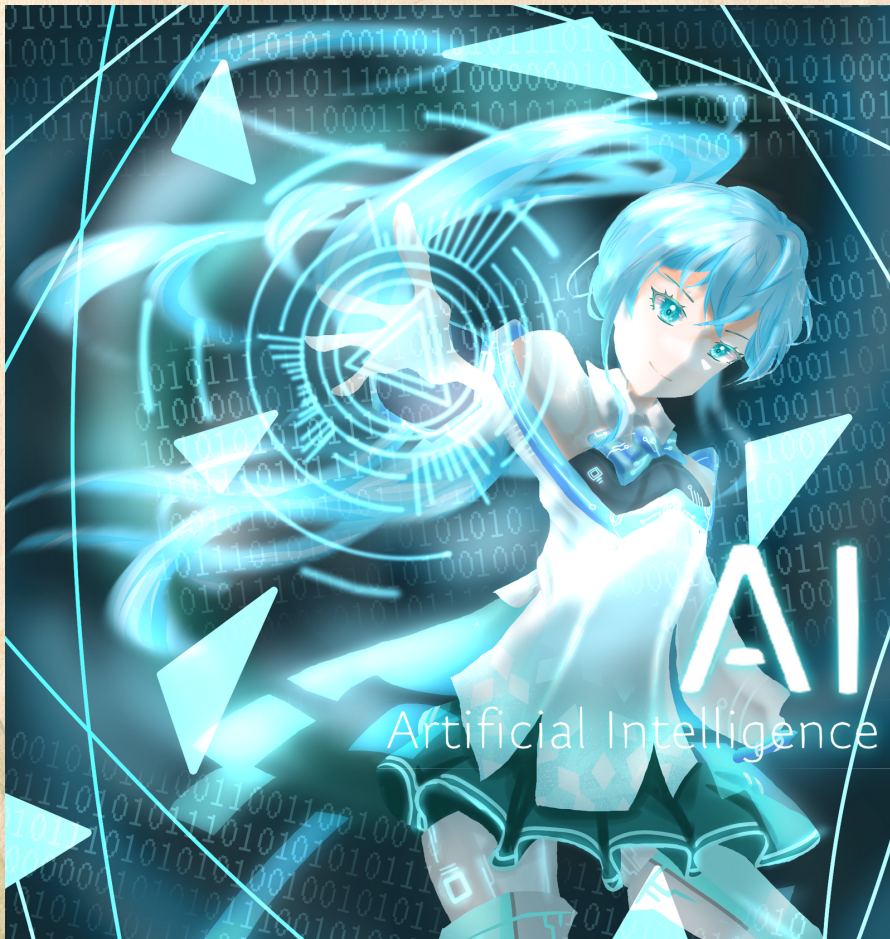
Call from Future~ Animated by Eva Ho (3C)

helpful information without restrictions of distance and time, while advanced transportation systems significantly shorten our time spent on daily commutes. Meanwhile, the evolution of smart homes releases metropolitan citizens from busy homework. All these transformations serve the same purpose – to shift human attention from time-consuming, repetitive work to economic development.