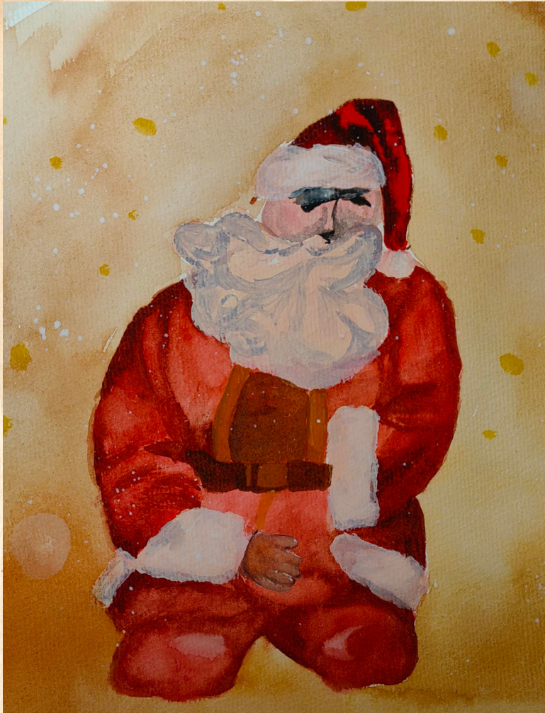
Painting of Santa