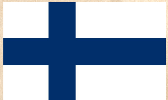
Flag of Finland